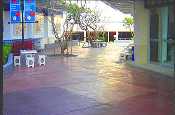
Homeworks Retail Outlet Pattaya