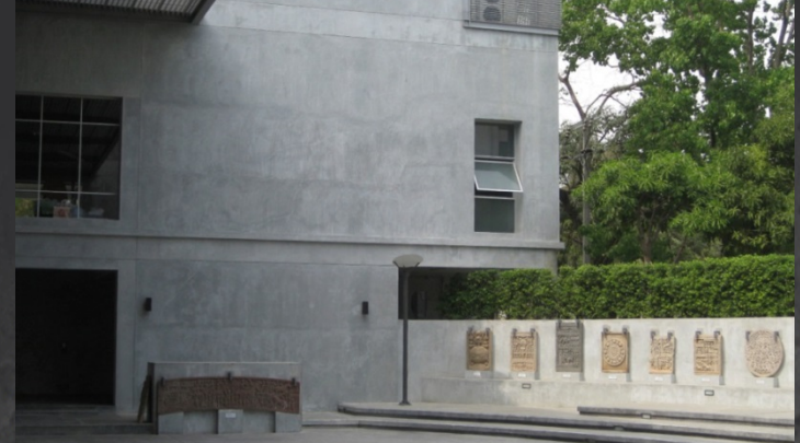
The BIA Art Gallery