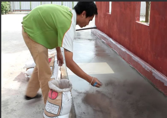
Crete Color is applied and worked into wet cement.