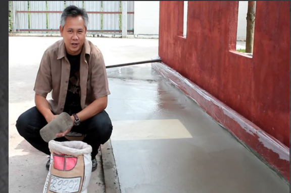
Prior to drying, area is ready for coloring