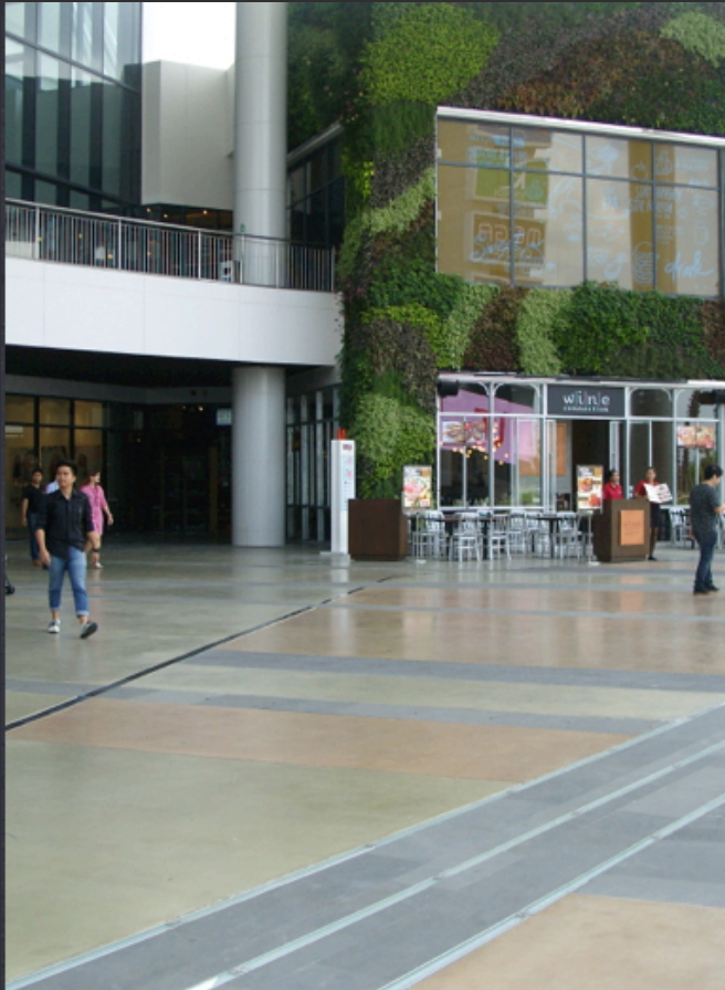
Mega Bagna Shopping Complex