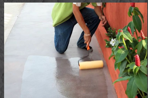
Silicone Gloss or matte Acrylic sealer is applied twice to dry surface