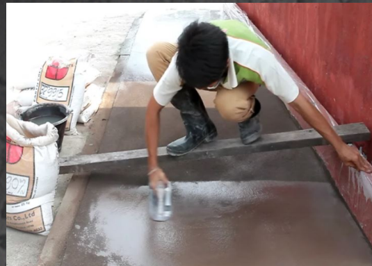
Repeated a second time