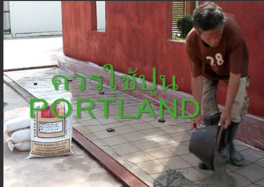
Area is filled with Portland cement