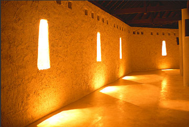
Six Senses Resort