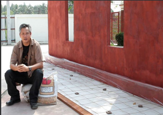
Floor prepared with reinforcement wire