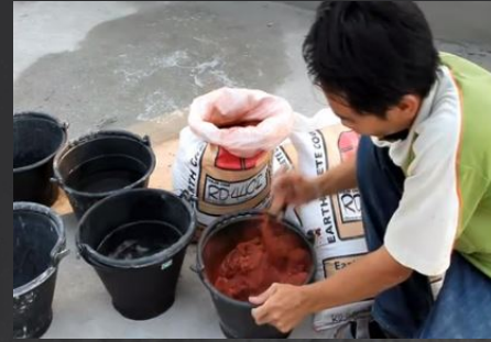
Crete Color is mixed with water