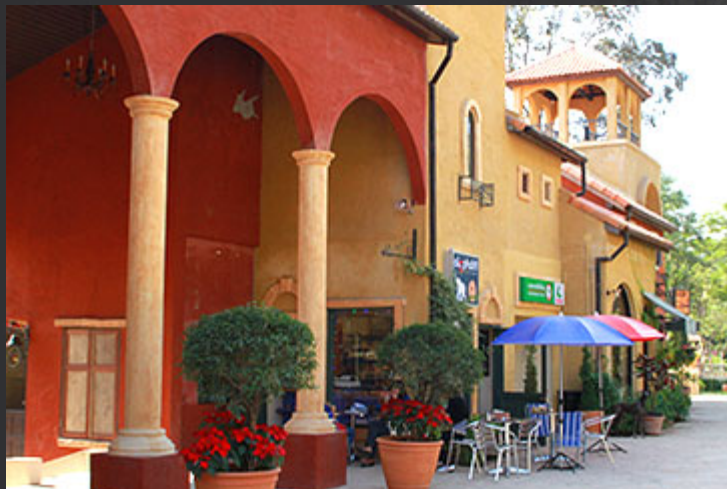
Palio Shopping Center