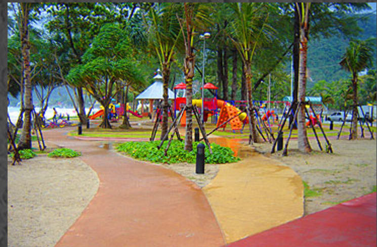
Patong Beach Walkway Phuket