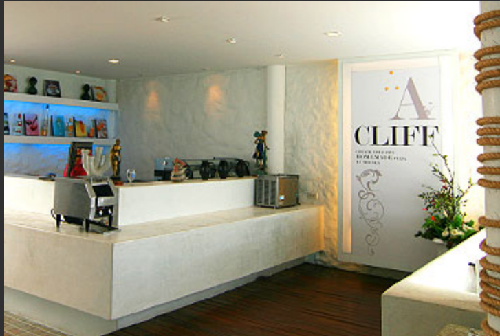
Golden Cliff House Restaurant