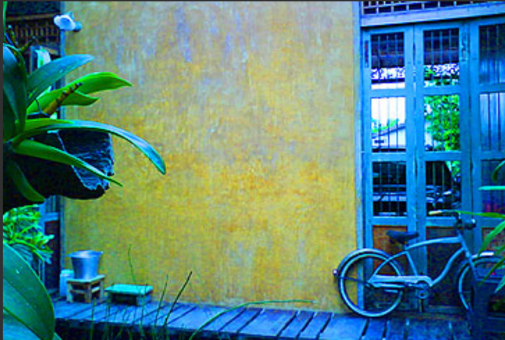
Baan DonMaung Bangkok