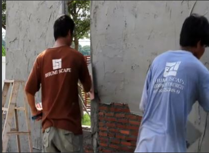
Cement base coat is rendered